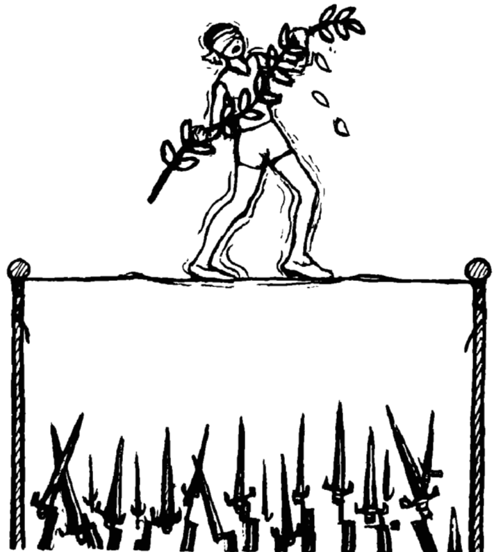
ILLUSTRATION BY PAUL MARCUS

The idea, of course, is to impress upon Palestinians, in as humiliating a way as possible, that Israel controls their economy. Likewise, their future political process. The Legislative Council of eighty-two people is to be elected next spring, al-